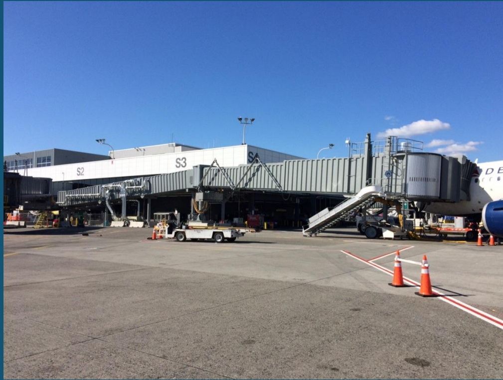
S4 International Corridor Connection